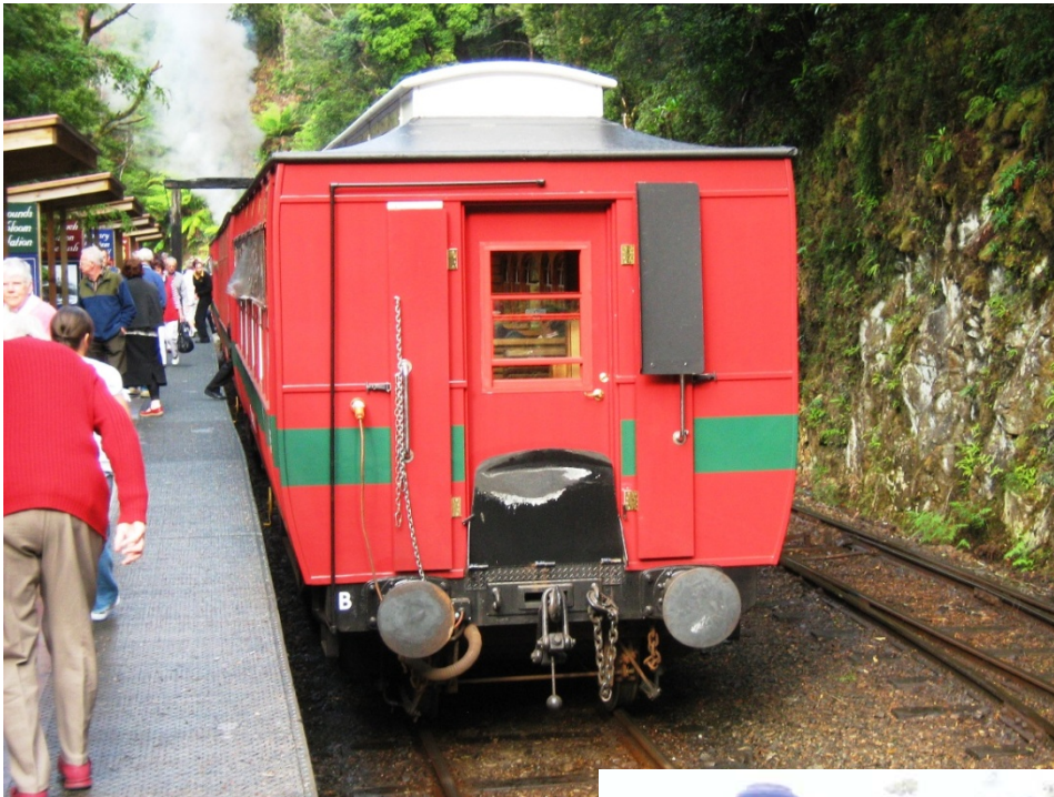
The beautiful faithfully built class 'O' replica of century old coaches.